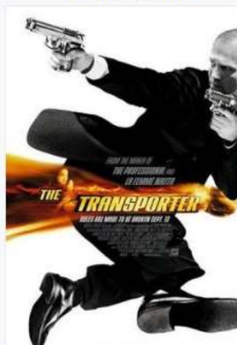
Theatrical release poster