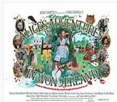
Theatrical release poster