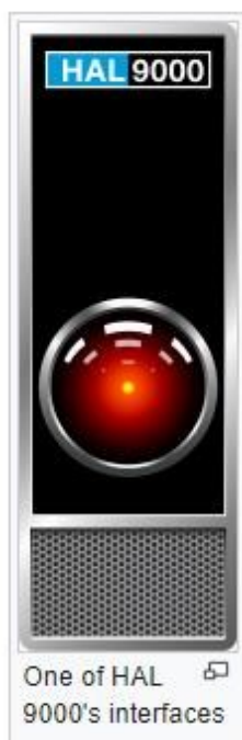
One of HAL 9000's interfaces

Release Title: 2010: The Year We Make Contact From: 1982 Novel Release date: 1984 (USA) Genre: Adventure, Mystery, Sci-Fi, Thriller Disc Nos. - 1 Certification: PG Duration: Region Code: Region B Product Code: MPN: EAN: UPC: