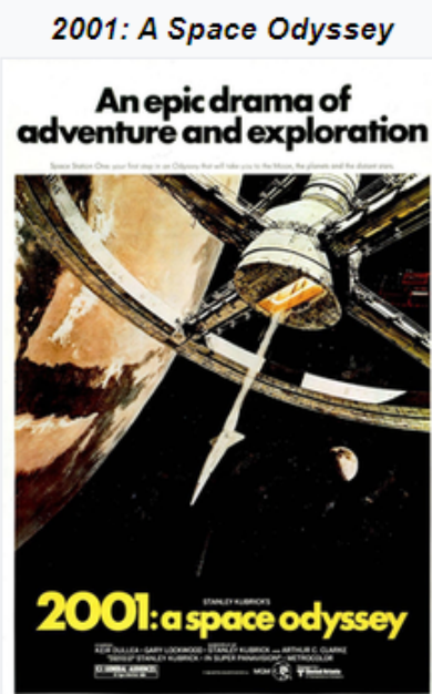
Theatrical release poster by Robert McCall

Release Title: 2001 A Space Odyssey Release date: 1968 (USA) Genre: Adventure, Sci-Fi Disc Nos. - 1 Certification: U Duration: Region Code: Region B Product Code: MPN: EAN: UPC: