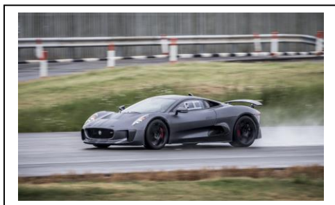
After being cancelled in 2012, the Jaguar C-X75 was recommissioned to appear in Spectre.

MPAA Rated PG-13 for intense sequences of action and violence, some disturbing images, sensuality and language.