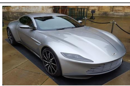
The Aston Martin DB10 is driven by Bond in The Film.