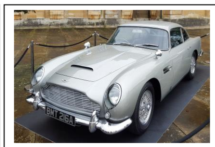
The Aston Martin DB5 reappears after reconstruction in Q's Workshop at the Film's ending, with Bond driving away With it.